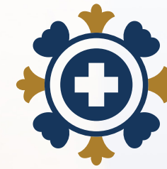
CLINICA ANGLO AMERICANA